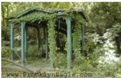
An overgrown trellis outside the Admiral's Row houses