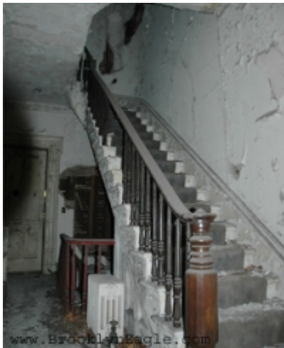
A stairwell inside one of the remaining Admiral's Row houses

Here the grocery store is shown from above.